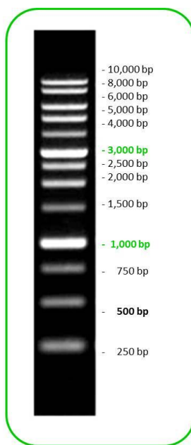
1% Agarose Gel 1xTAE (250-10,000 bp) 13 Fragments